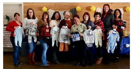
Ladies of Liberty

January Baby Showers ~ Last month was blessed with showers! Ladies of Liberty and Catholic Daughters of America separately and graciously hosted baby showers for the Center.