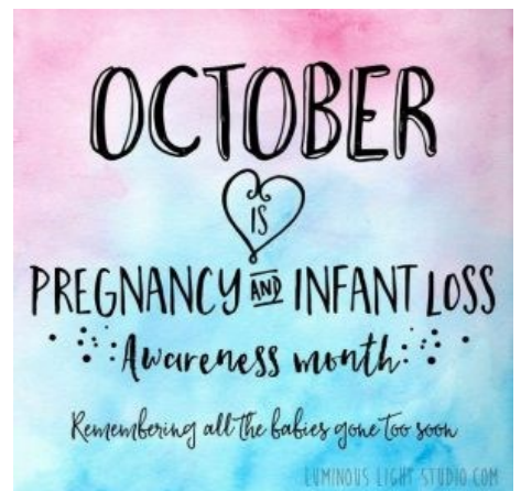
Remembering our babies in heaven.

Mon, Wed & Thurs (9:30-3:00 pm); Tues. (11-5:00 pm) Friday (9:30-12:30 pm)