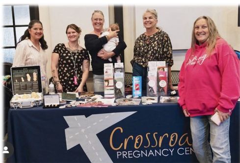
Mission Sunday @ SVCC - Lemoore