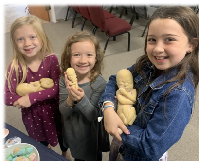
Mission Sunday @ Grace Baptist - Lemoore