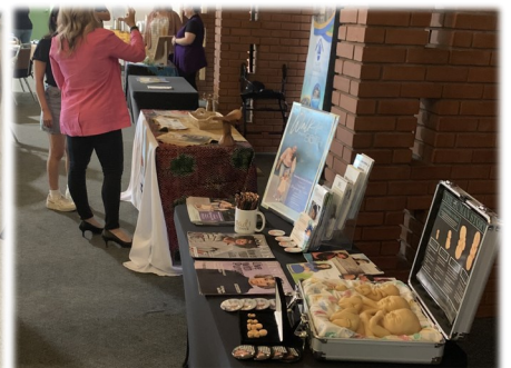
Mission Banquet @ Glad Tidings Church